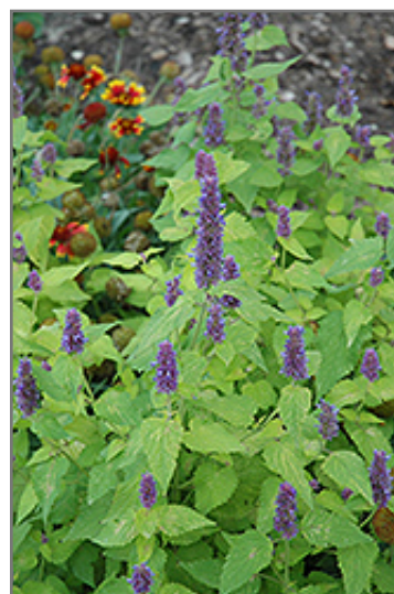
Golden Jubilee Anise Hyssop flowers

Golden Jubilee Anise Hyssop is recommended for the following landscape applications;