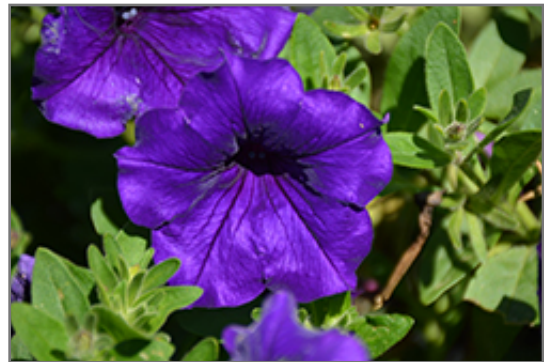
Easy Wave Blue Petunia flowers