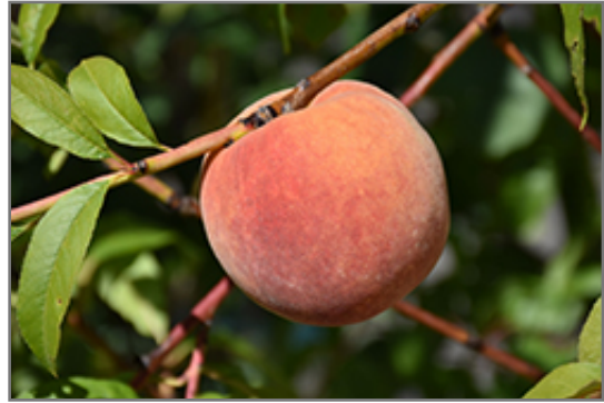
Redhaven Peach fruit

Redhaven Peach is covered in stunning clusters of fragrant pink flowers along the branches in early spring, which emerge from distinctive rose flower buds before the leaves. It has dark green foliage throughout the season. The narrow leaves turn yellow in fall. The fruits are showy yellow drupes with a red blush, which are carried in abundance in mid summer. The fruit can be messy if allowed to drop on the lawn or walkways, and may require occasional clean-up.