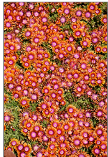
Fire Spinner Ice Plant flowers