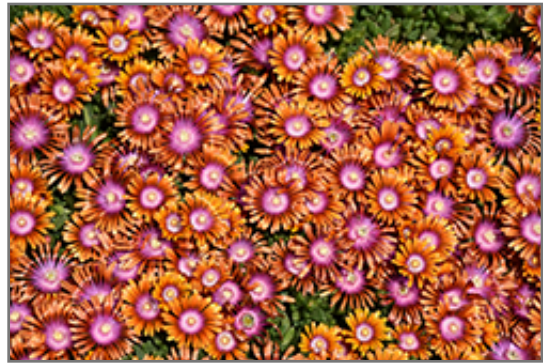
Fire Spinner Ice Plant in bloom