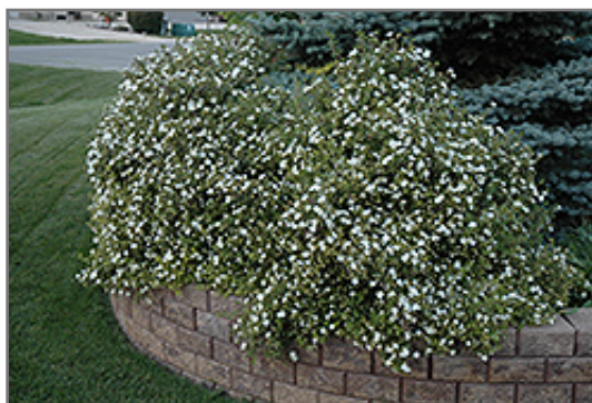
Abbotswood Potentilla in bloom