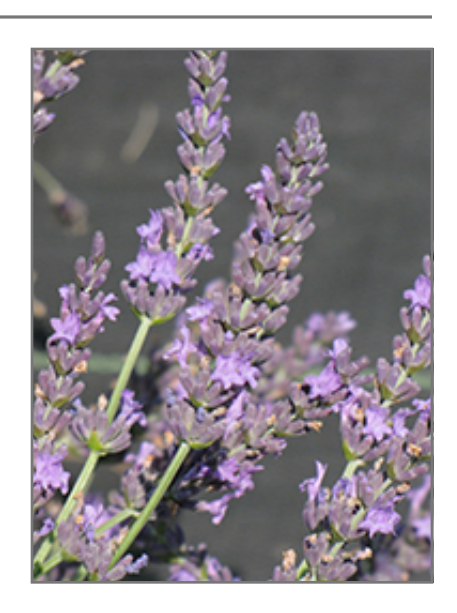
Grosso Lavender flowers