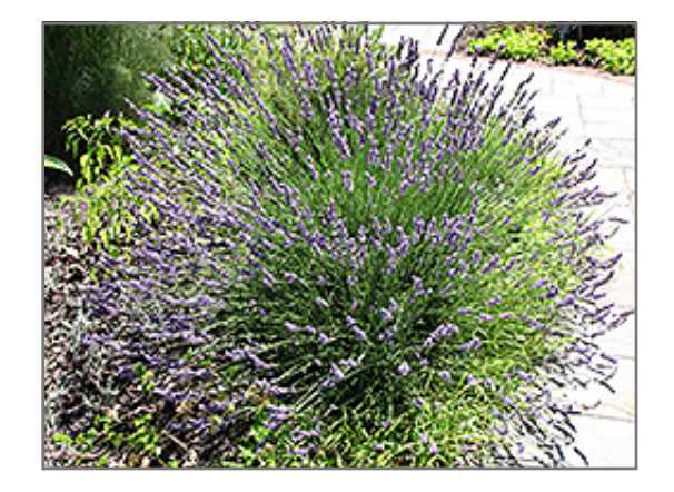
Grosso Lavender in bloom