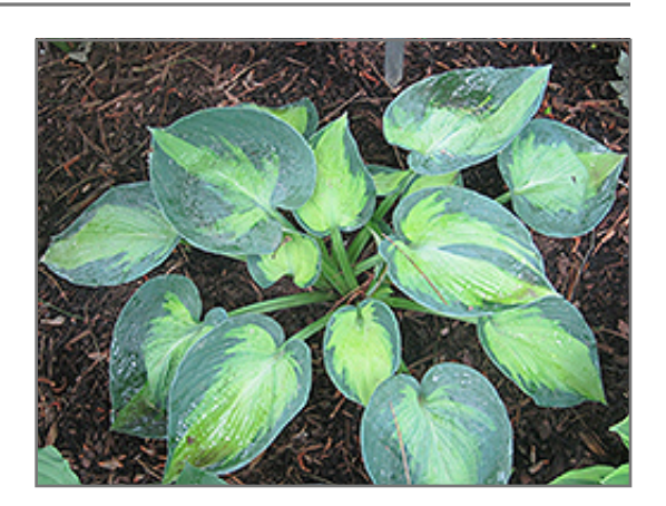
Heat Wave Hosta

A chartreuse leaf center that matures to gold with wide steel blue margins that age to blue-green; leaf is rounded and heart shaped; spikes of near white flowers in early to mid-summer; an eye catching addition to the garden or border