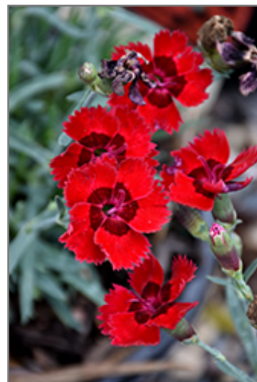
Fire Star Pinks flowers