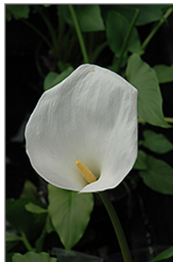
Calla Lily flowers