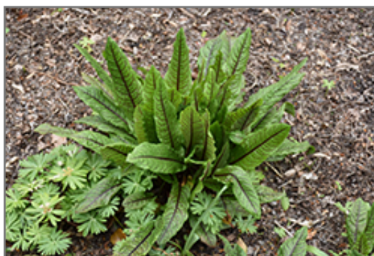
Ornamental Sorrel